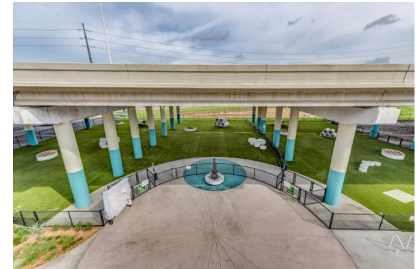
Kotfila Memorial Dog Park

THEA uses toll revenues to provide our region with a transportation system that provides regional connectivity to our residents and visitors.