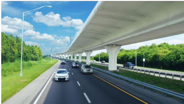
Selmon Reversible Express Lanes

As an independent agency of the state, THEA owns, maintains, and operates four facilities within Hillsborough County: the Selmon Expressway, the Brandon Parkway, Meridian Avenue, and the Selmon Greenway. The agency is focused on driving innovation and improving mobility and safety throughout the Tampa Bay region.