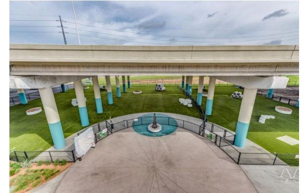
Kotfila Memorial Dog Park

THEA uses toll revenues to provide our region with a transportation system that provides regional connectivity to our residents and visitors.